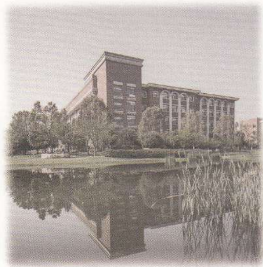
ZJUT Teaching Building