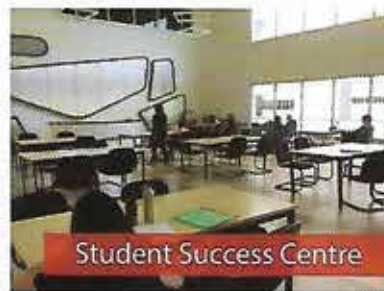
Student Success Centre