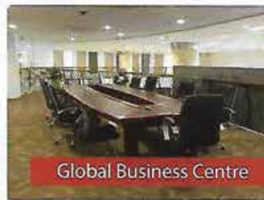
Global Business Centre